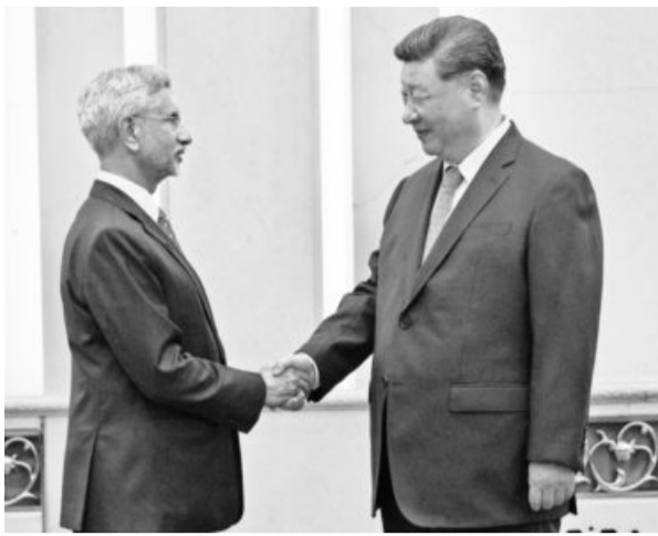
Union External Affairs Minister S Jaishankar during a meeting with the Chinese President Xi Jinping, in Beijing on Tuesday. Jaishankar said he apprised President Xi about the recent development in bilateral ties

Jaishankar called for improved transit facilities and better connectivity among SCO member states. "One of them is the lack of assured transit