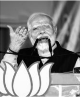
Prime Minister Modi during a rally at Arambagh on Friday

Arambagh, Hooghly district, he said, “The whole country is sad and is seething with anger after seeing what the TMC, which beats the drum of Maa, Mati, and Manush, has done to the sisters of Sandeshkhali.” “The TMC leader crossed all limits of audacity with the sisters and daughters in Sandeshkhali. What TMC has done to the sisters of Sandeshkhali is a matter of shame,” he said.