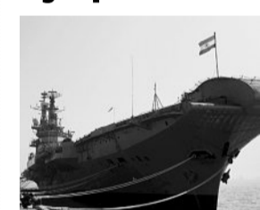
INS Viraat docked at the naval dockyard, ahead of its decommissioning after 30 years of service

PRESS TRUST OF INDIA Ahmedabad, 10 February