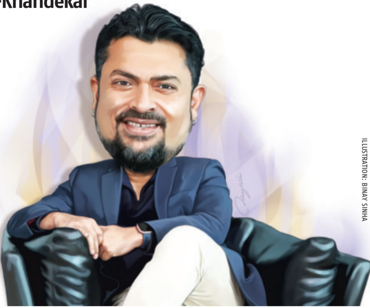
ILLUSTRATION: BHAVI SHINHA

Sanyal keeps emphasising the importance of non-film music in India's Rs 1,500-crore music business. The three labels that Universal Music India has built under him are all about it. Mass Appeal India, the Indian arm of the eponymous New York-based culture firm, is about finding and promoting popular Indian hip-hop artists like Divine. It is Divine's story that inspired Zoya Akhtar's Gully Boy