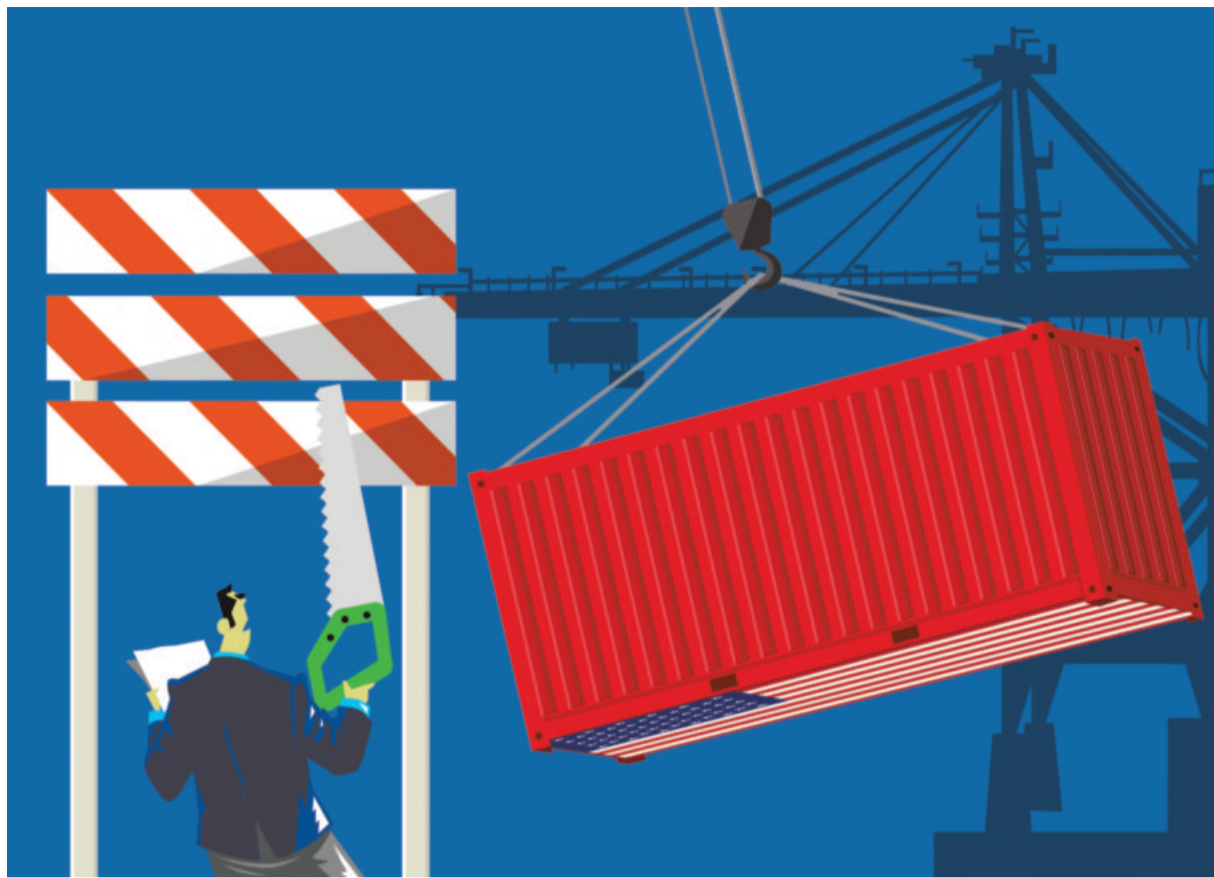
ILLUSTRATION: BINAY SINHA